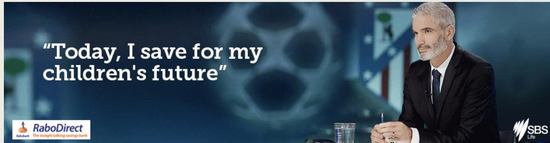
Billboard/ Impact Billboard (970px x 250px)