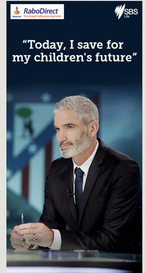
Half Page (300px x 600px)