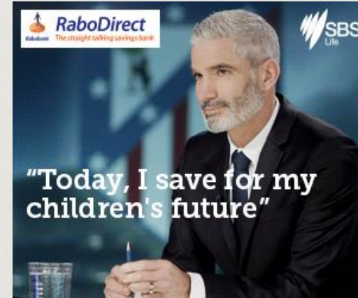
MREC (300px x 250px)